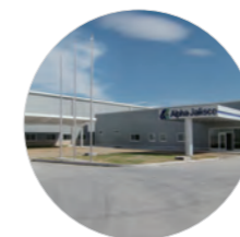
⑮ Alpha Industry Jalisco, S.A. DE C.V.