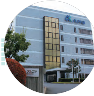
⑰ ALPHA Corporation