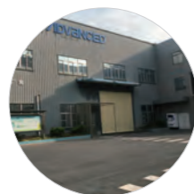
⑦ ALPHA ADVANCED AUTOMOTIVE PARTS CO.,LTD.