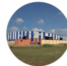
⑫ Alpha Security Instruments (India) Private Limited