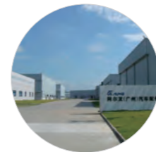
⑤ ALPHA (GUANGZHOU) AUTOMOTIVEPARTS CO.,LTD.