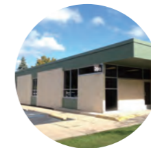
⑬ ALPHA TECHNOLOGY CORPORATION