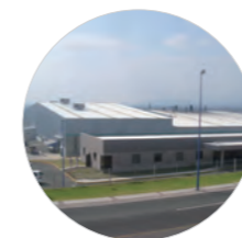
⑭ ALPHA INDUSTRY QUERETARO, S.A. DE C.V.