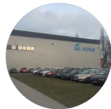
① Alpha Vehicle Security Solutions Czech s.r.o.