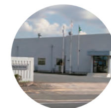
⑲ Kyushu Alpha Co., Ltd.