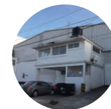
⑯ ALPHA INDUSTRY PUEBLA, S.A. DE C.V.