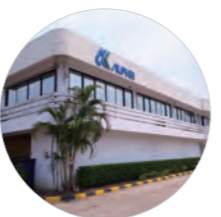
⑩ ALPHA HOUSING HARDWARE (THAILAND) CO.,LTD.