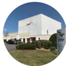
② Société de Peinture de Pièces Plastiques SAS