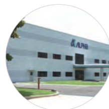
⑨ ALPHA INDUSTRY (THAILAND) CO.,LTD.