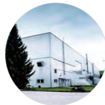
③ SPPP Slovakia s.r.o.